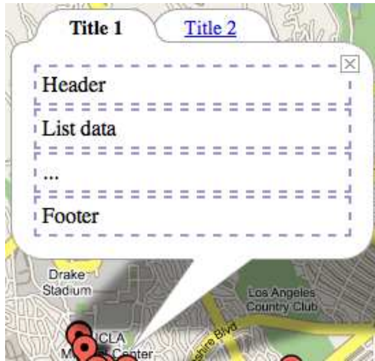
Figure 1: The anatomy of a “bubble”

Which would, on the first tab, list the theater name and a list of movies playing, and on the second tab, list each movie and its showtimes. The appearance of these elements in an actual Google Maps bubble is depicted in Figure 1.